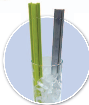
◀ Innergy and Aluminum in a 32 degree ice bath