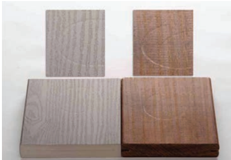
Clubhouse Brazilian Hardwood