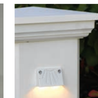
Endurance Ultra Thin Down Light Black and White matte finish