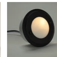
Berkley Round Step Light Black, White and Antique Bronze