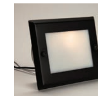
Genesis Step Light Black, White and Antique Bronze

Plus, we provide a remote to allow you to conveniently turn our lights on and off, as well as dim and brighten.