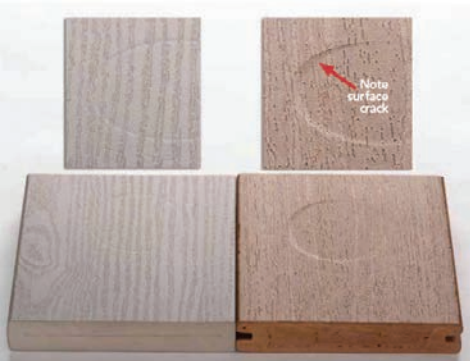
Clubhouse Competitive Cellular PVC Decking

Laboratory impact tests* prove that Clubhouse Decking with Korelite technology has better impact resistance.