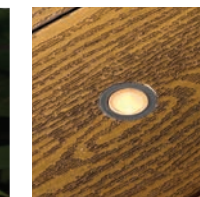
Phoenix Recessed Deck Lights Purchase complete installation kits or packs of lights